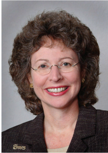
MAYOR PAM IORIO