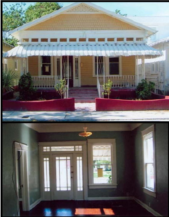
Residential Structure "After"