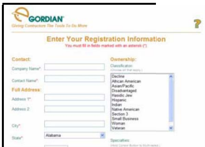
REGISTER WITH EGORDIAN®

To find out more about Job Order Contracting opportunities in your area, please visit http://tools.egordian.com/ to register your company and search the database. Once the City of Tampa's JOC Program is underway, opportunities with the City will also be listed on http://www.tampagov.net/dept_Purchasing/ .