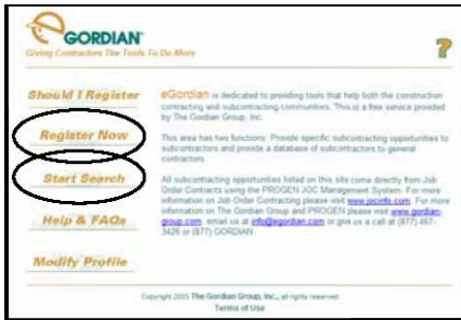
EGORDIAN TOOLS WEBSITE WINDOW

SUBCONTRACTORS and SUPPLIERS can search for Job Order Contracting opportunities by trade and location.