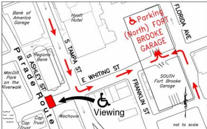
Parking and Viewing Location Detail