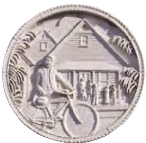
The above medallion is part of the decoration on the interstate overpasses in Ybor City.

When the interstate expansion project was in its early planning stages over a decade ago, preservation concerns surfaced about the impact