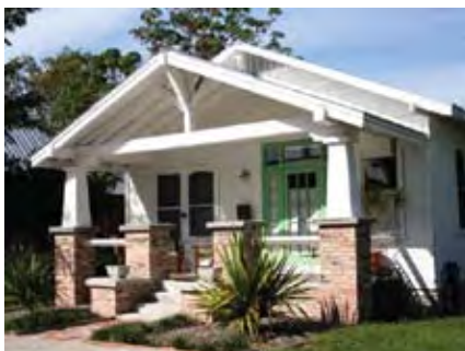
Ybor City residence at 918 E. 11th Avenue (Grant Program).

the area, and must exhibit a financial need. The deadline for the next Grant Fund application cycle is on June 5, 2007 at 3 p.m.