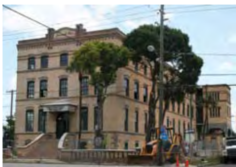
Former Berriman-Morgan Cigar Factory (Loan Program).