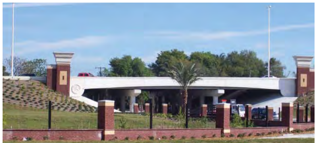
I-4 overpass in Ybor City with decorative details.

of such a project on Tampa's historic districts. These concerns were concentrated in Ybor City. The community clearly remembered when the historic district was subsequently divided into two neighborhoods because of the 1960s' interstate construction.