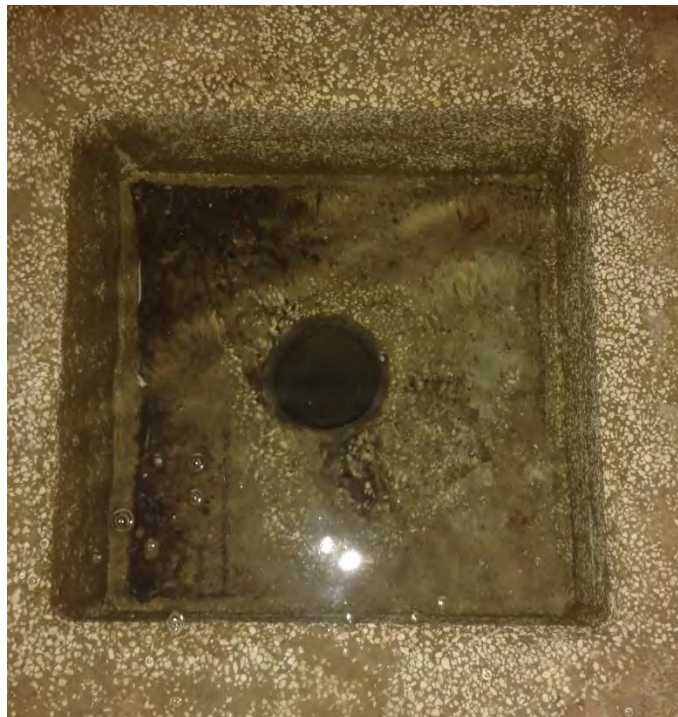
Figure 8. MBPS East GST Floor Drain Issues were not seen on the existing floor drain.