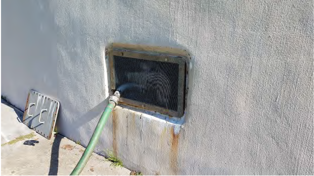
Figure 17. MBPS East GST North Manway Cast steel manway frame and aluminum alloy manway cover. Coating was peeling from the frame and corrosion and pitting were found on the cover.