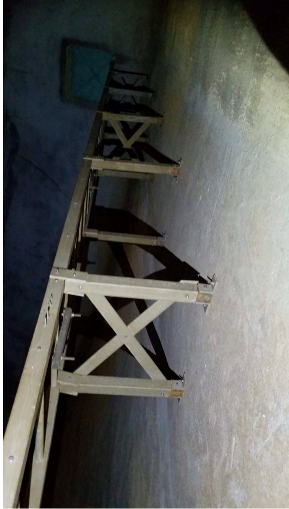
Figure 9 and Figure 10. MBPS East GST Interior Access Ladder Issues were not seen on the existing access ladder.