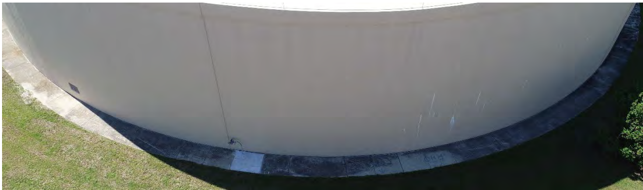
Figure 16. West MBPS GST Exterior Tank Wall Cracks in the exterior tank wall.