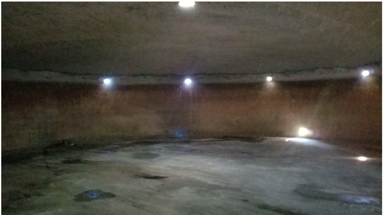
Figure 1. MBPS East GST Interior Facing South