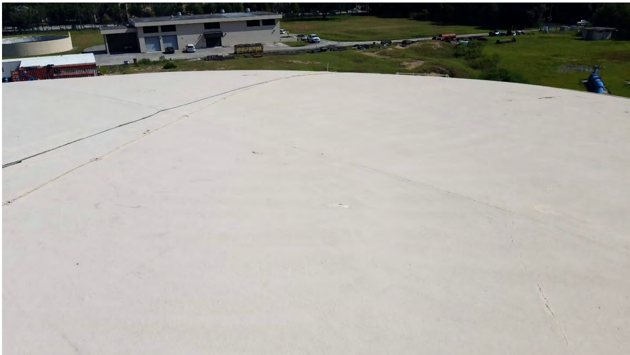
Figure 22. MBPS East GST Dome Minor cracks on the dome.