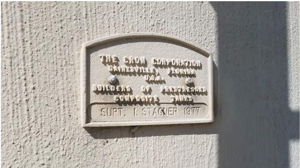
Figure 14. MBPS East GST Identification Plate from 1977