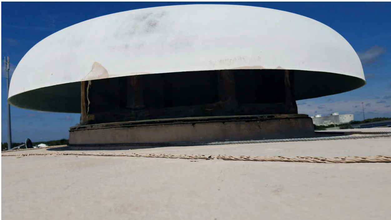
Figure 20. MBPS East GST Center Dome Vent The center dome vent was in good condition with minor corrosion on metal vent supports and minor cracking on vent curb.