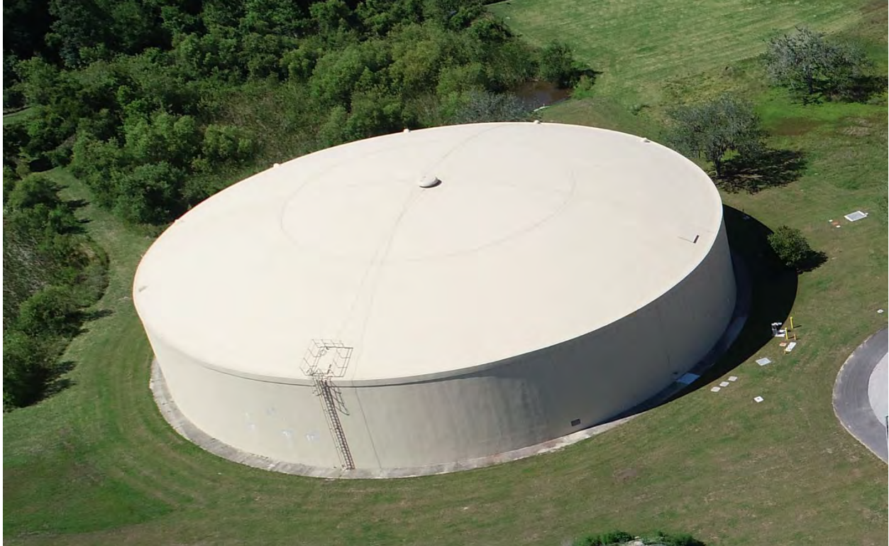
Figure 15. MBPS East GST Exterior Tank Wall Repaired Cracks in the exterior tank wall.