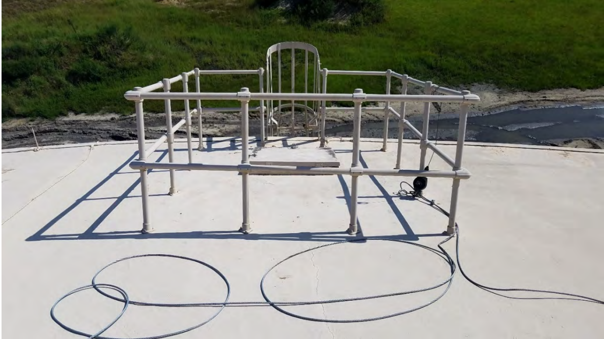
Figure 19. MBPS East GST Dome Access Hatch, Handrails and Top of the Exterior Ladder Cage Fiberglass dome access hatch, aluminum alloy handrails and top of the exterior galvanized steel ladder cage. The aluminum and galvanizing were in good condition. Hardware on the fiberglass access hatch was rusting. There was cracking on the hatch curb.