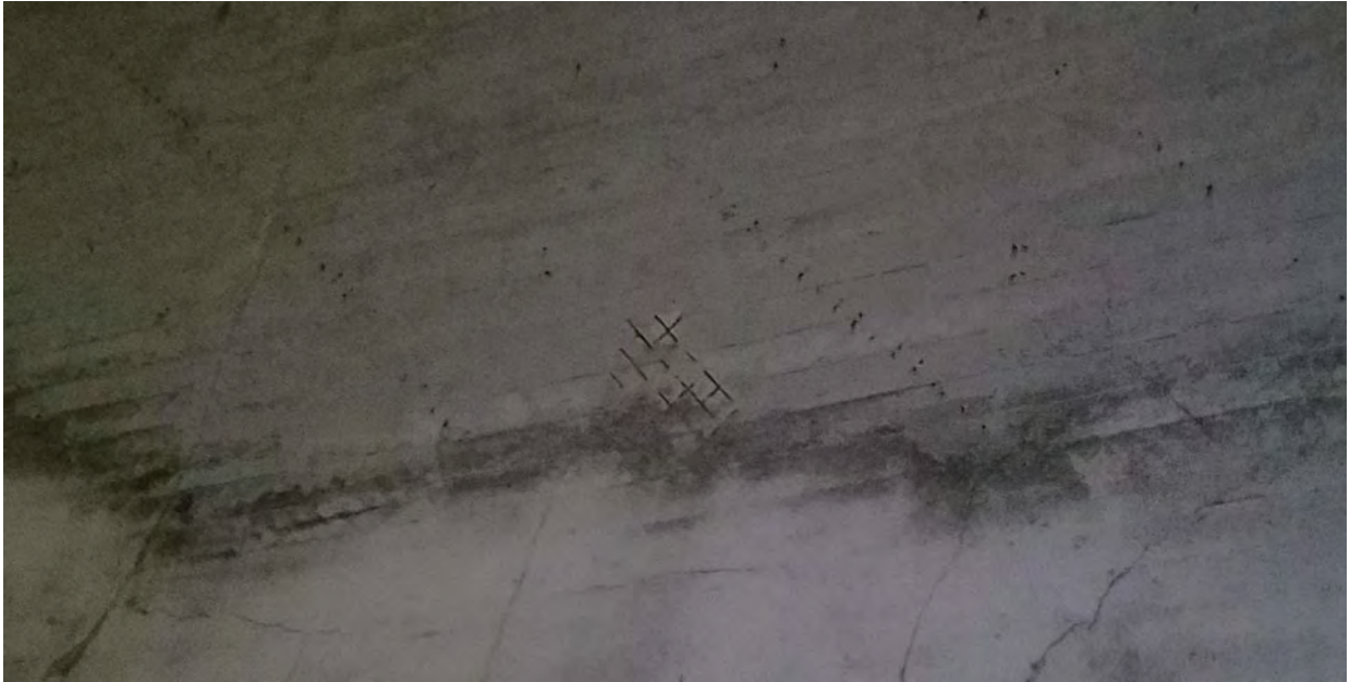
Figure 5. MBPS East GST Interior Dome Concrete loss (spalling) in the interior dome has also occurred and has exposing steel mesh.