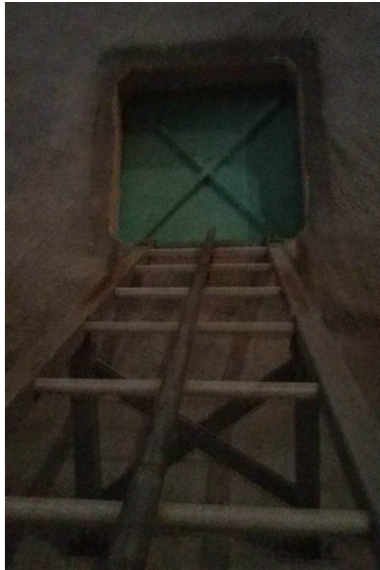
Figure 12. MBPS East GST Secondary Interior Access Hatch Possible rain leaks or minor concrete repairs.