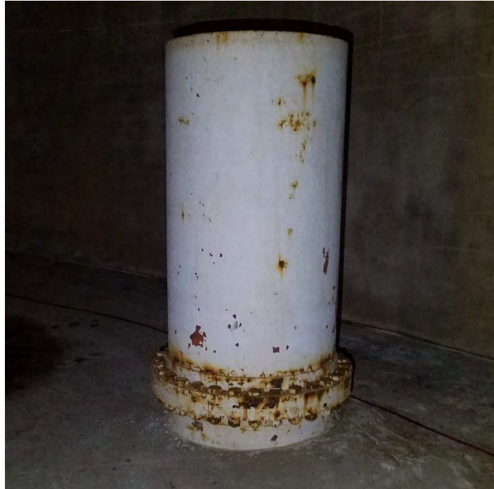
Figure 7. MBPS East GST Interior DIP Pipe Corrosion on an upper section of coated interior pipe.