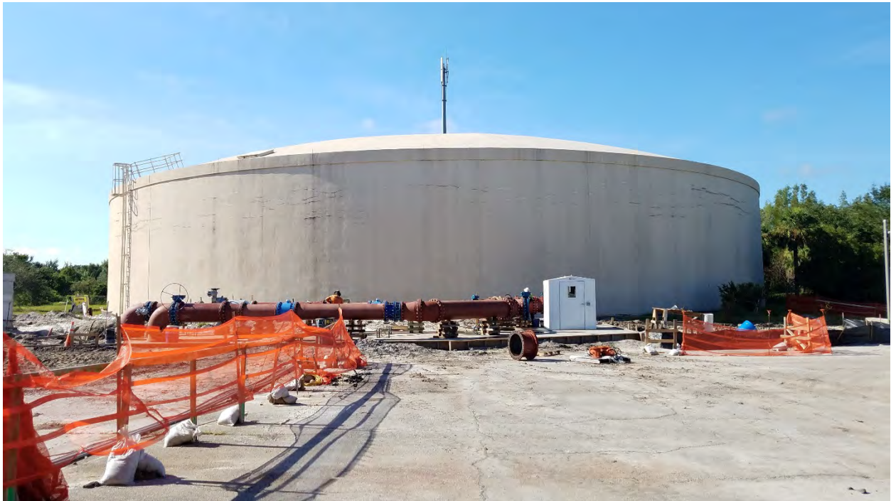
Figure 13. MBPS East GST Exterior Facing Southwest