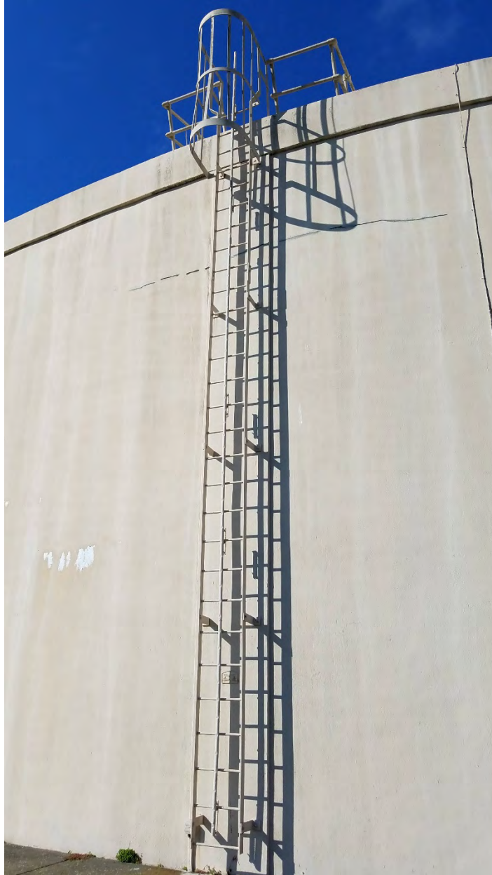
Figure 18. MBPS East GST Exterior Ladder The exterior galvanized steel ladder and climbing device are in good condition.