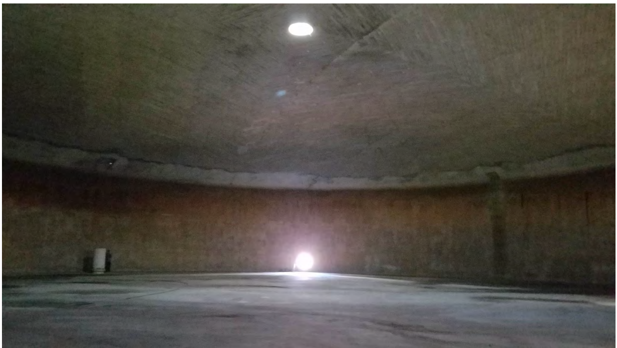
Figure 2. MBPS East GST Interior Facing North