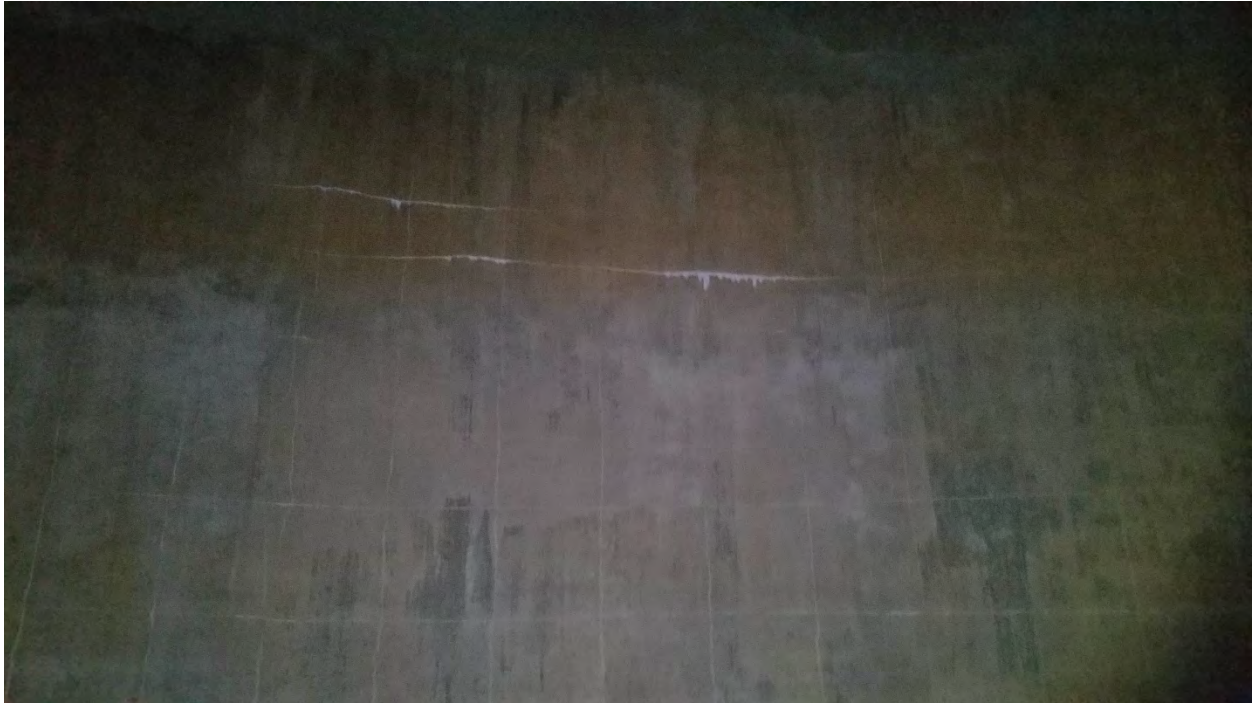
Figure 3. MBPS East GST Interior Concrete Walls The interior tank wall had efflorescence along cracks in the concrete.