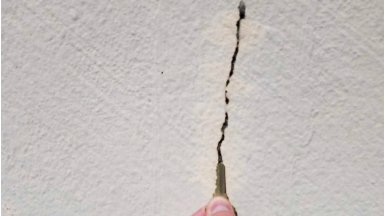
Figure 23. MBPS East GST Dome Minor cracks on the dome.