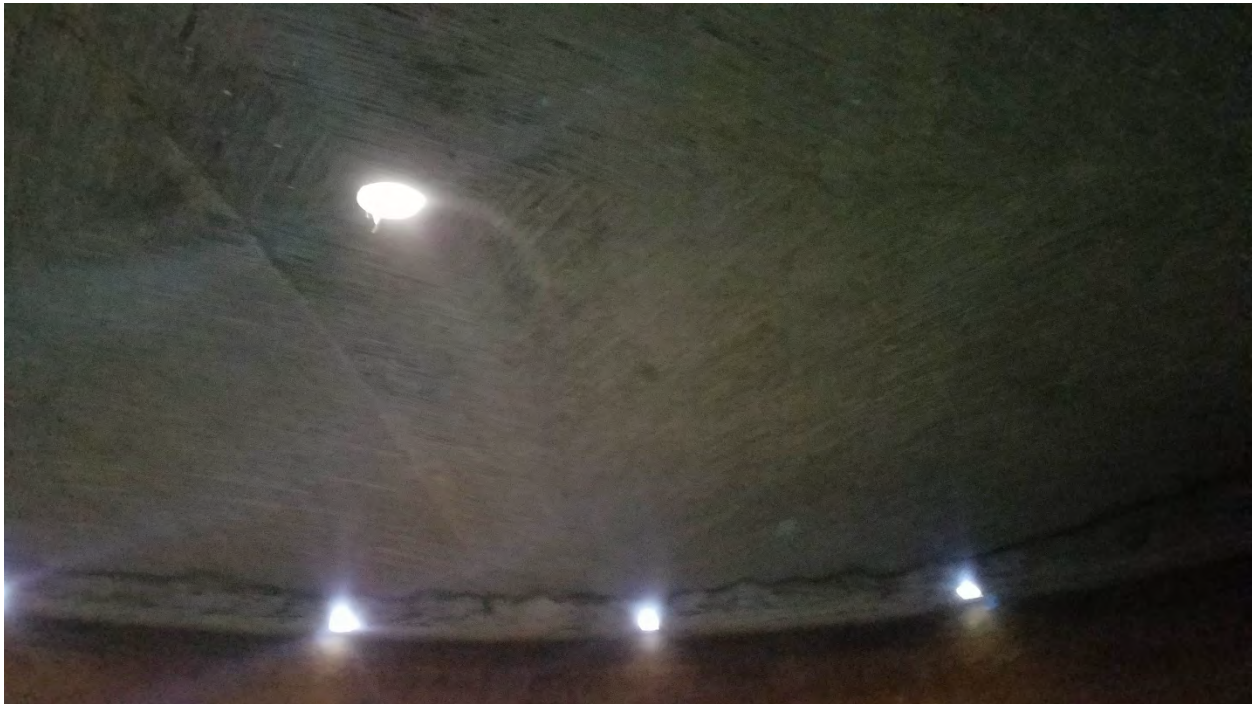
Figure 4. MBPS East GST Interior Dome Cracks and efflorescence were also present in the tank interior dome.