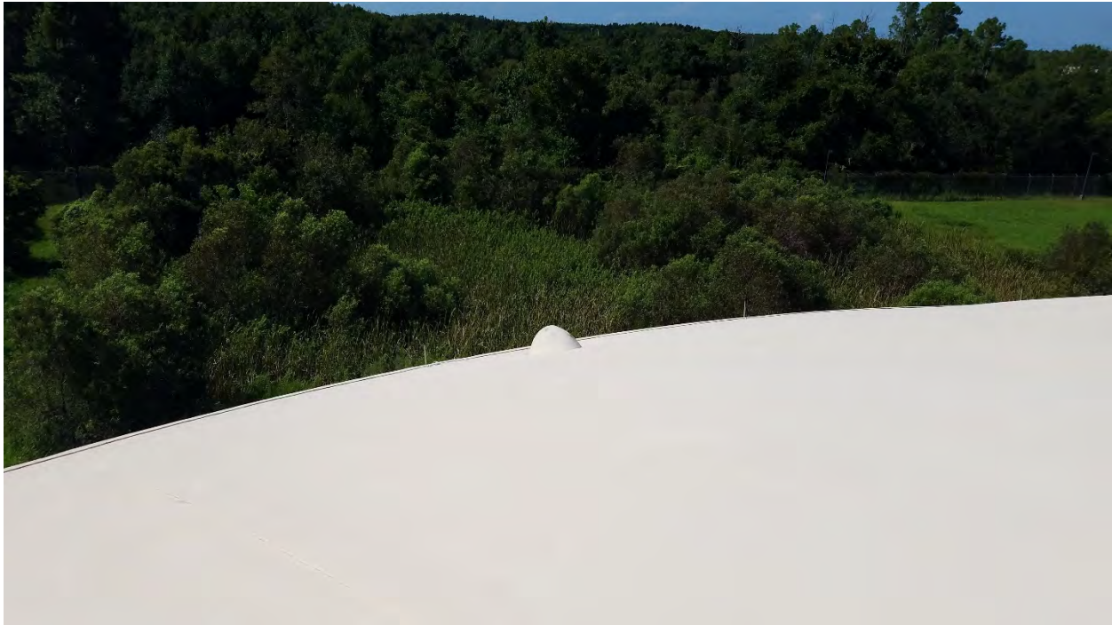
Figure 21. MBPS East GST Perimeter Dome Vents The perimeter dome vents were in good condition with minor cracking.