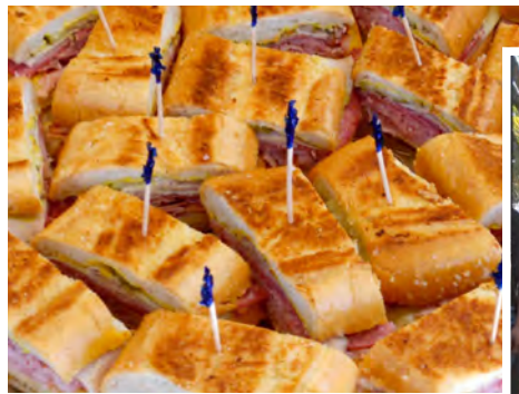
Ybor City cigar workers ate what was originally called the mixto. The mixto was transformed into the Cuban sandwich when the Sicilians added Genoa salami.