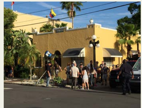
"The Infiltrator" movie filming at Casa de Lala at 1901 East 5th Avenue.