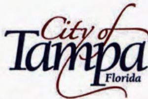
EXHIBIT "D" DIVERSITY MANAGEMENT INITIATIVE (DMI) FORMS