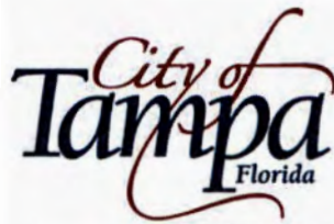
EXHIBIT “A” SCOPE OF SERVICES