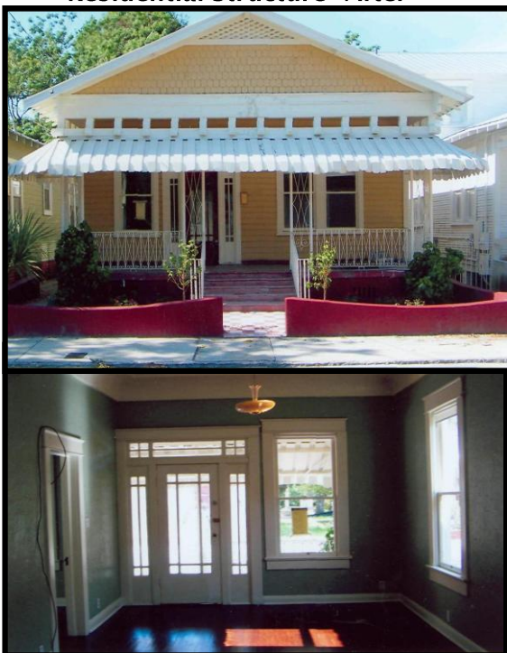
Residential Structure "After"